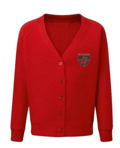
EYFS - Year 5